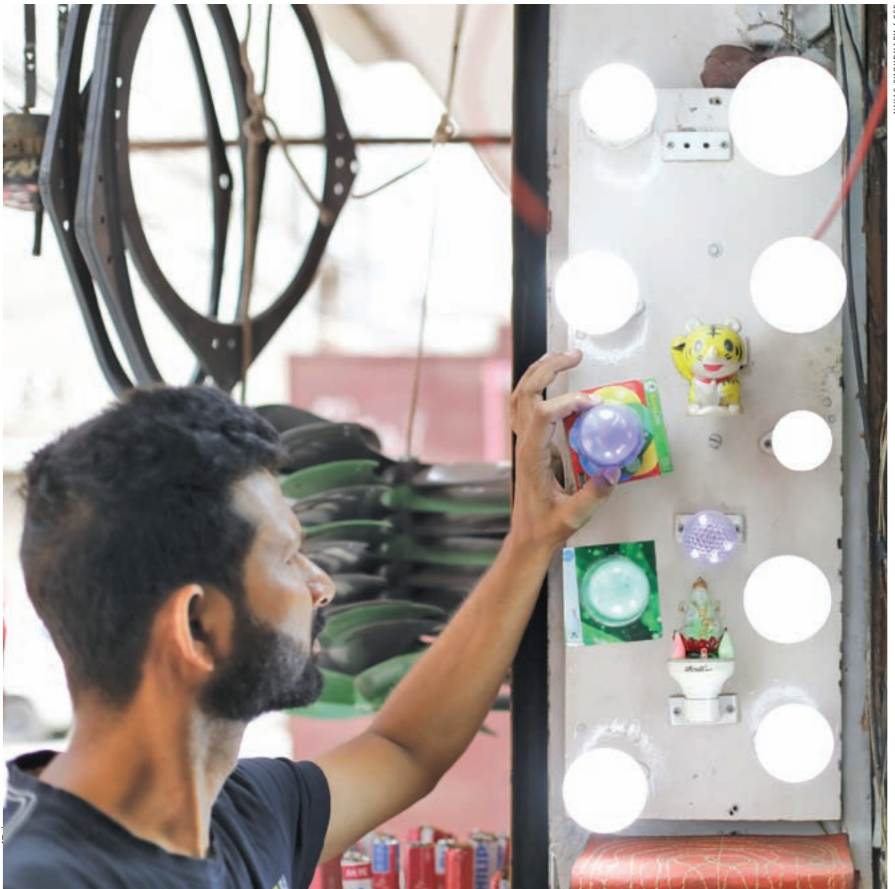
VIKAS CHOUDHARY / CSE