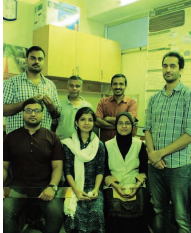
The team from the Indian Institute of Science, Bengaluru, which developed a method to block the blue peaks from LED lights

Exposure of the retina and lens to blue peaks from LED lights can increase the risk of cataract and age-related macular degeneration